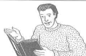
I like this book . It's interesting. Me gusta este libro. Es interesante.