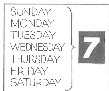
There are seven days in a week. Hay siete días en una semana.