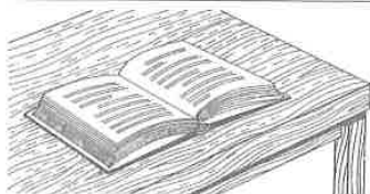
There's a book on the table. Hay un libro sobre la mesa.